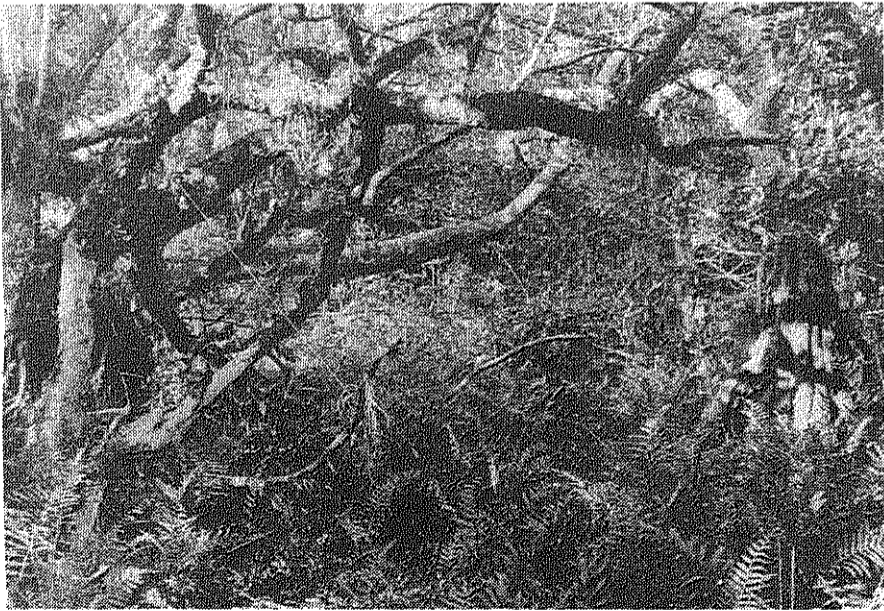
Typical pre-development growth in the Glades.

The picture below shows some of the typical growth that existed in the Glades at that time.