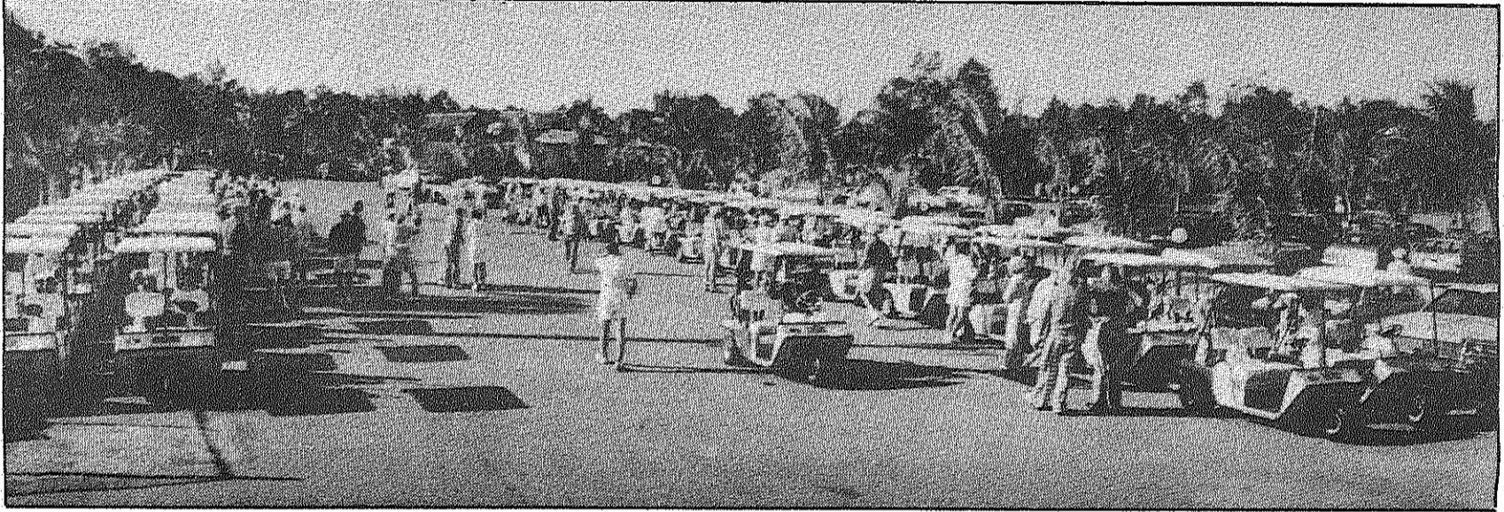
We do Play Golf. The above photo shows golf carts lined up for one of the Glades "Scrambles" last winter.

(Published in the interest of those who live in the Glades)